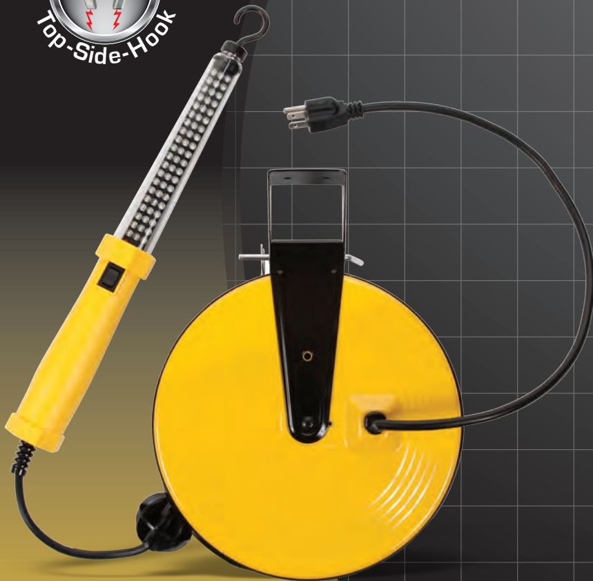
Model SL-864 50 ft. cord on retractable metal reel mounting kit included