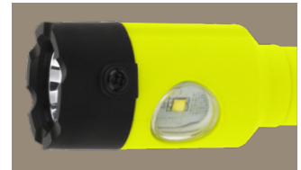
Integrated floodlight for close-up illumination.