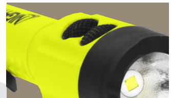
Easily activate flashlight & floodlight with top-mounted dual switches .