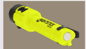
Integrated magnet on base and deep concealment reversible pocket clip for convenient hands-free use .