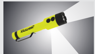
Dual light mode provides maximum safety and utility.